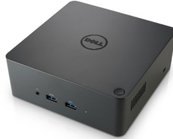
Dell Thunderbolt™ Dock | TB16