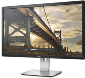
Dell 27 Ultra HD Monitor | P2715Q